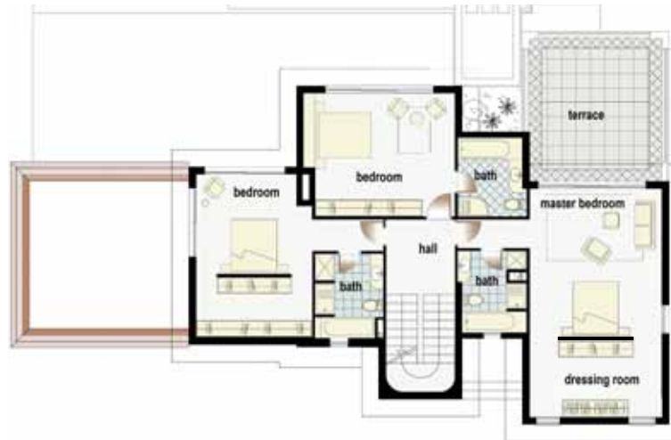
Type D villas are the mirror image of the C Type villa Type D villas are 444m 2 (296m 2 total covered area)